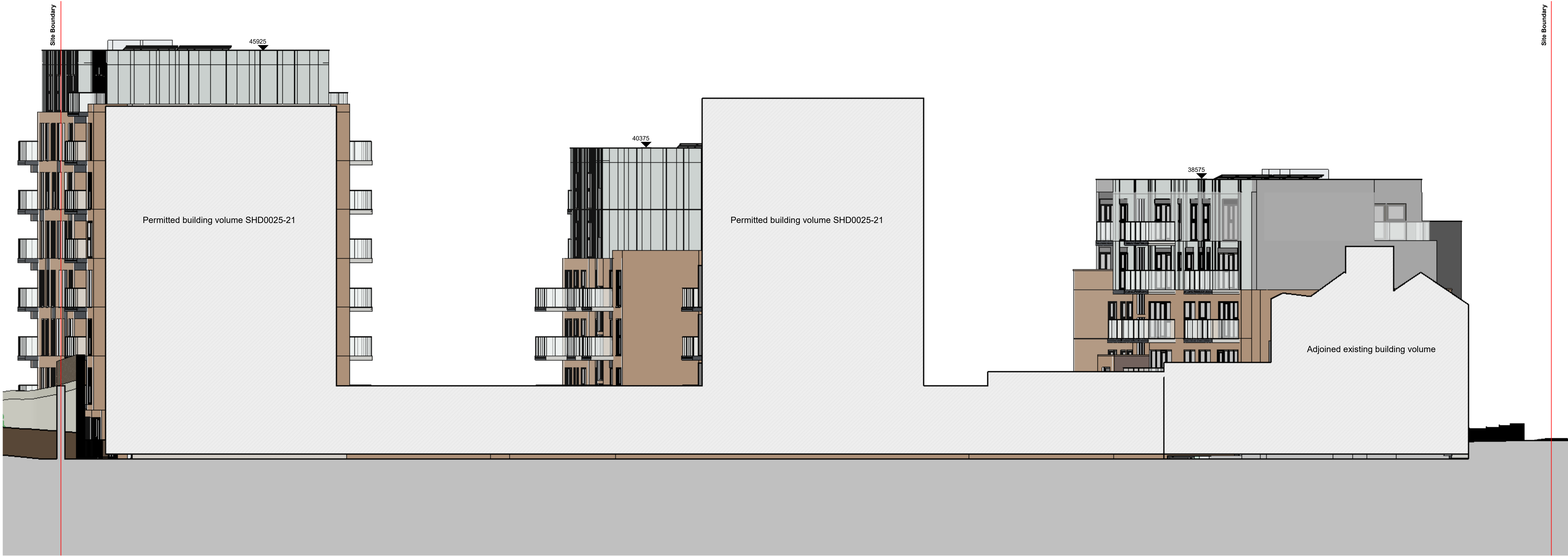
2 Elevation - North Elevation REF