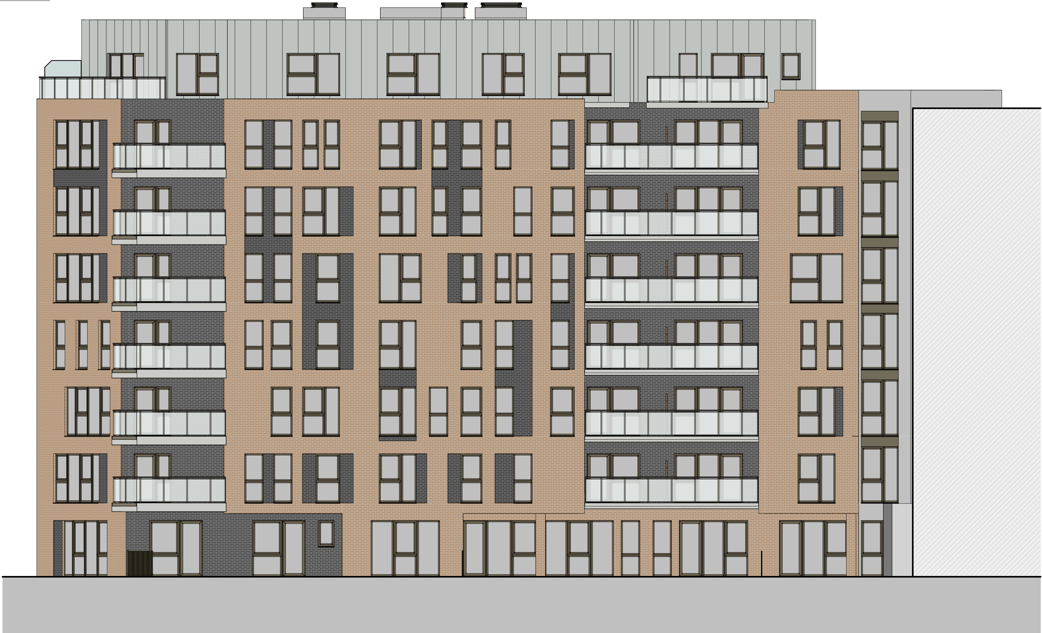
2 C East Elevation AMENDED