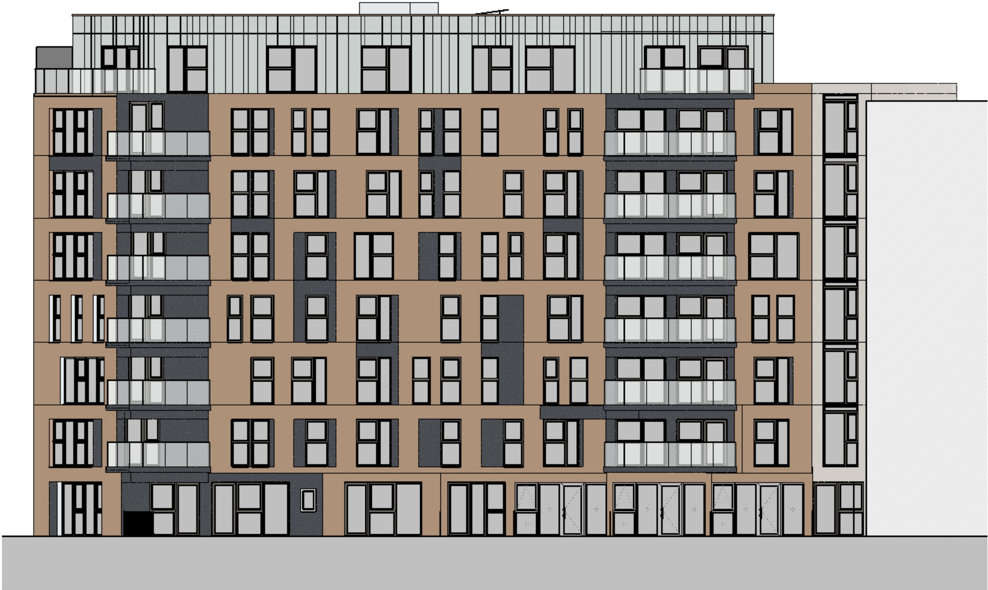
1 C East Elevation PLANNING GRANTED