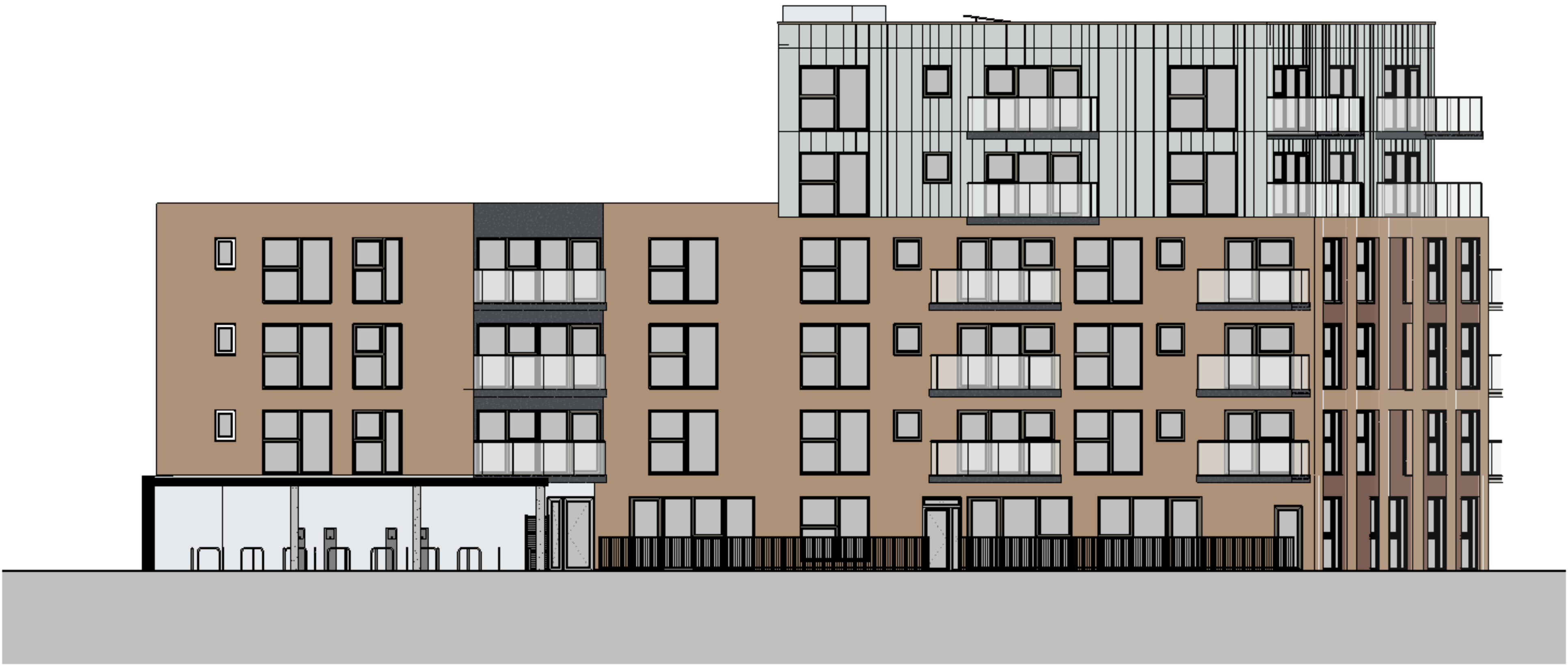
1 B West Elevation PLANNING GRANTED