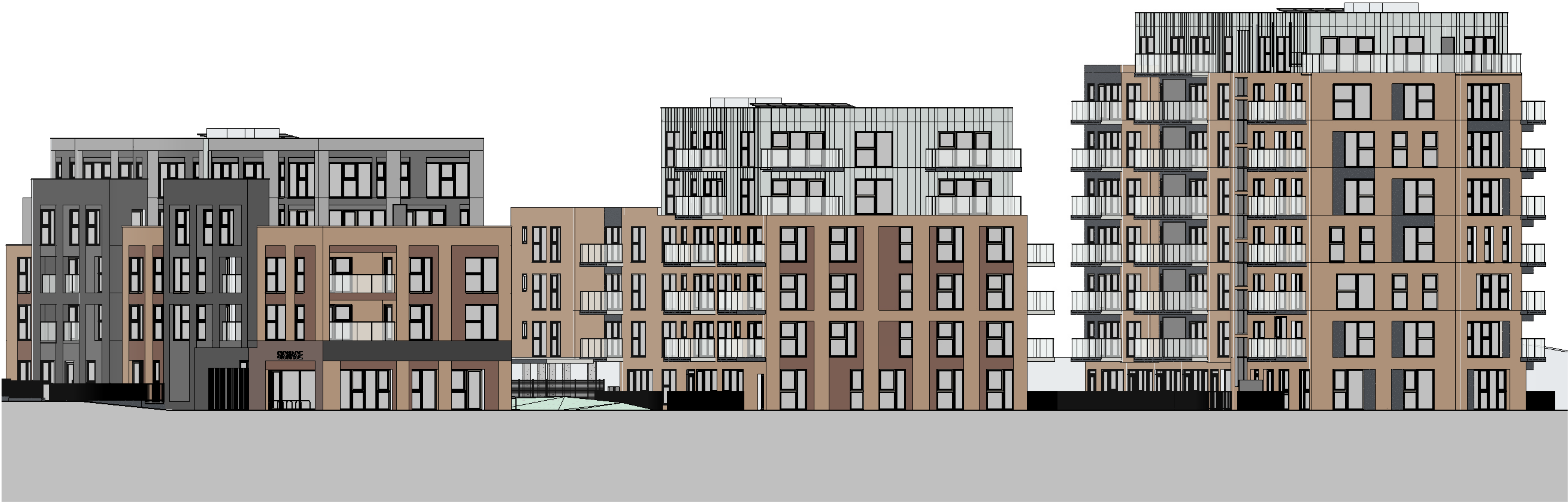
2 A,B,C South Elevation PLANNING GRANTED 1: 100