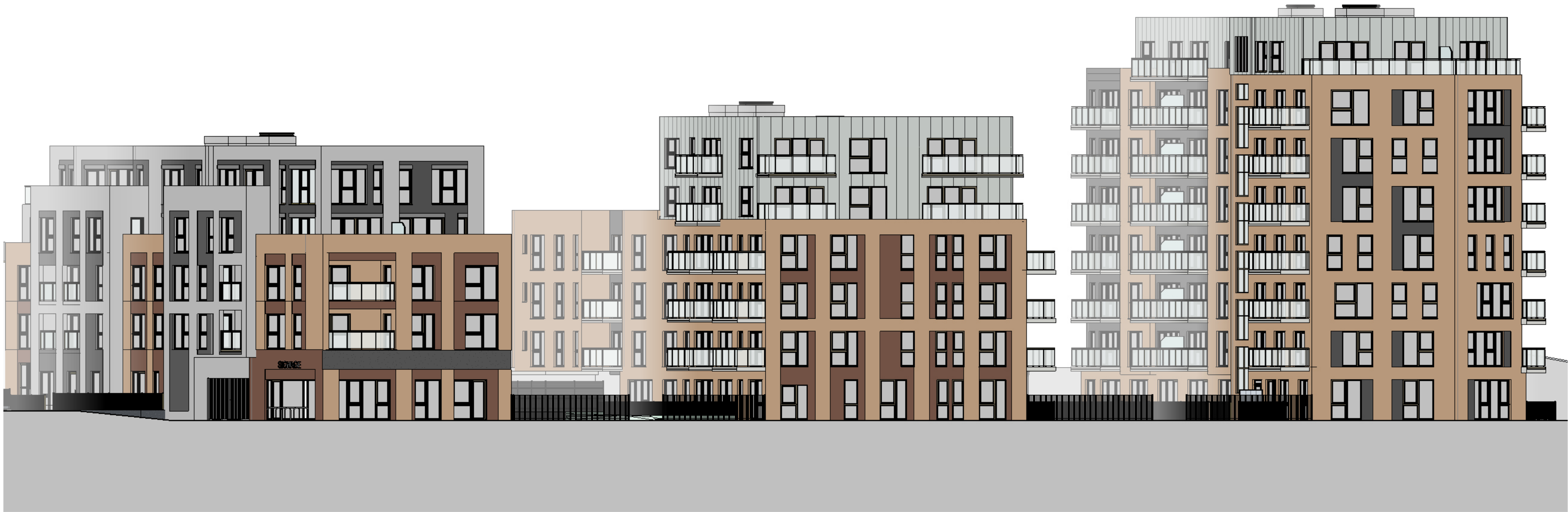
1 Elevation - South Elevation AMENDED 1: 100