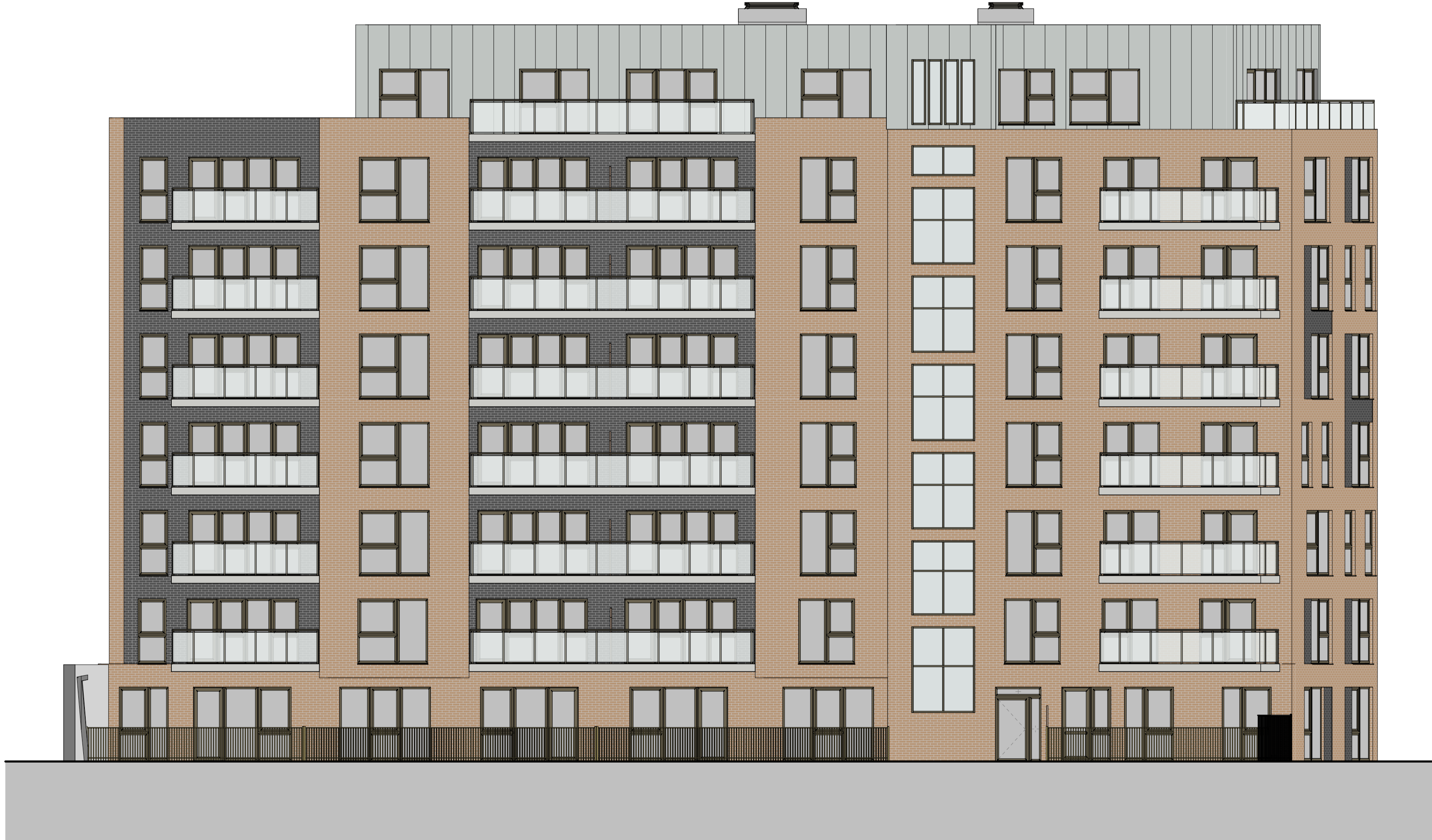
2 C West Elevation AMENDED