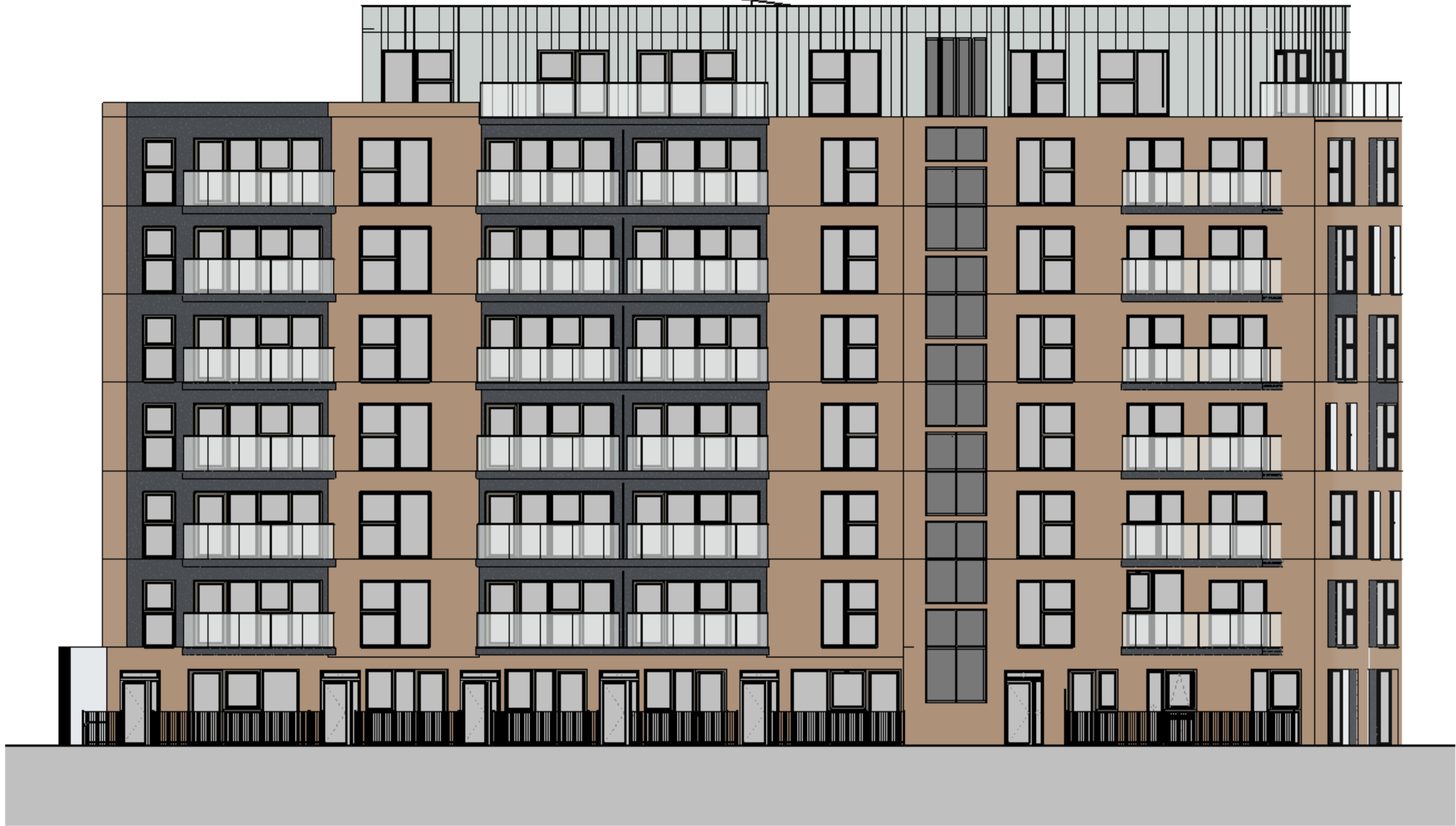
1 C West Elevation REF