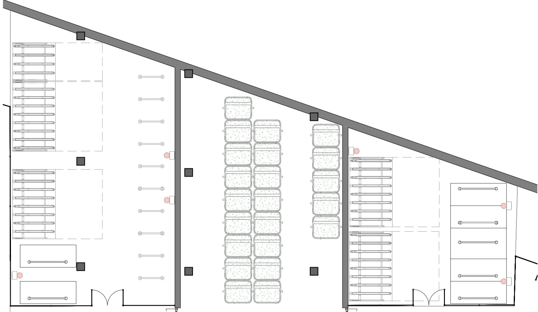
1 00 B Ground Floor GA Plan PLANNING AMENDED