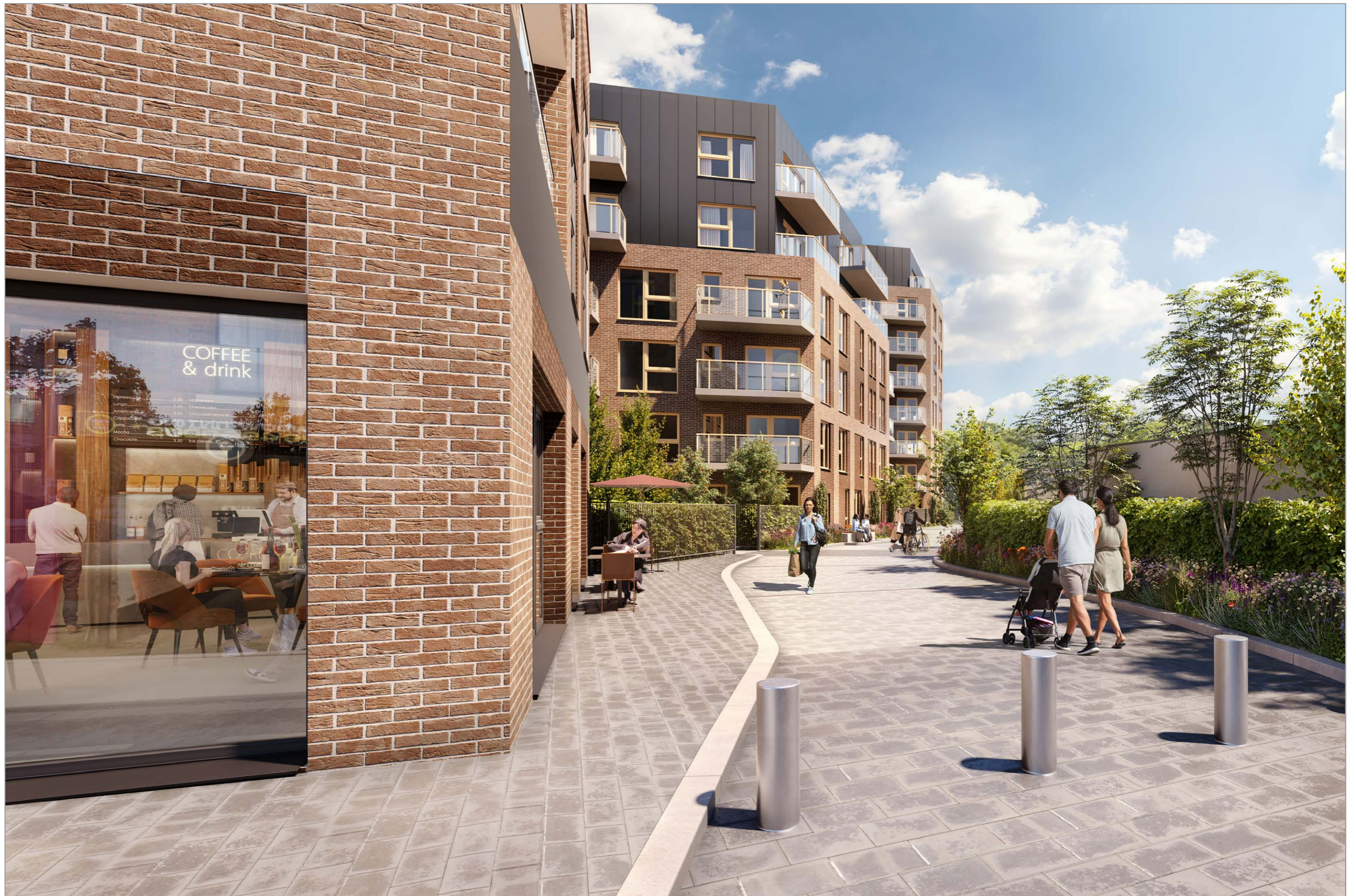
Location CGI 01 Proposed